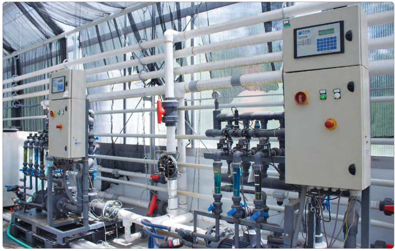
Two panel mount units used in a fertigation system